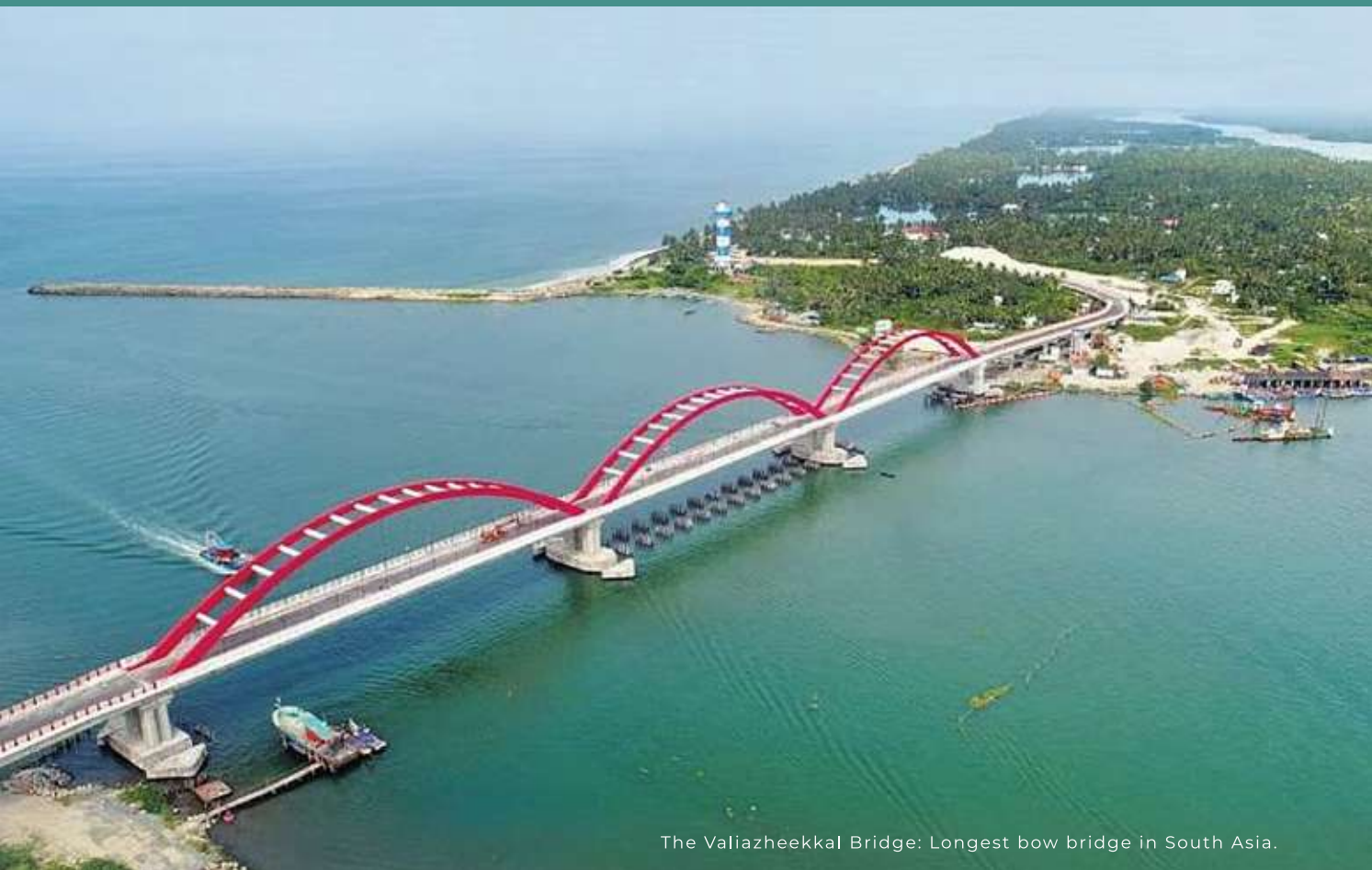
The Valiazheekkal Bridge: Longest bow bridge in South Asia.