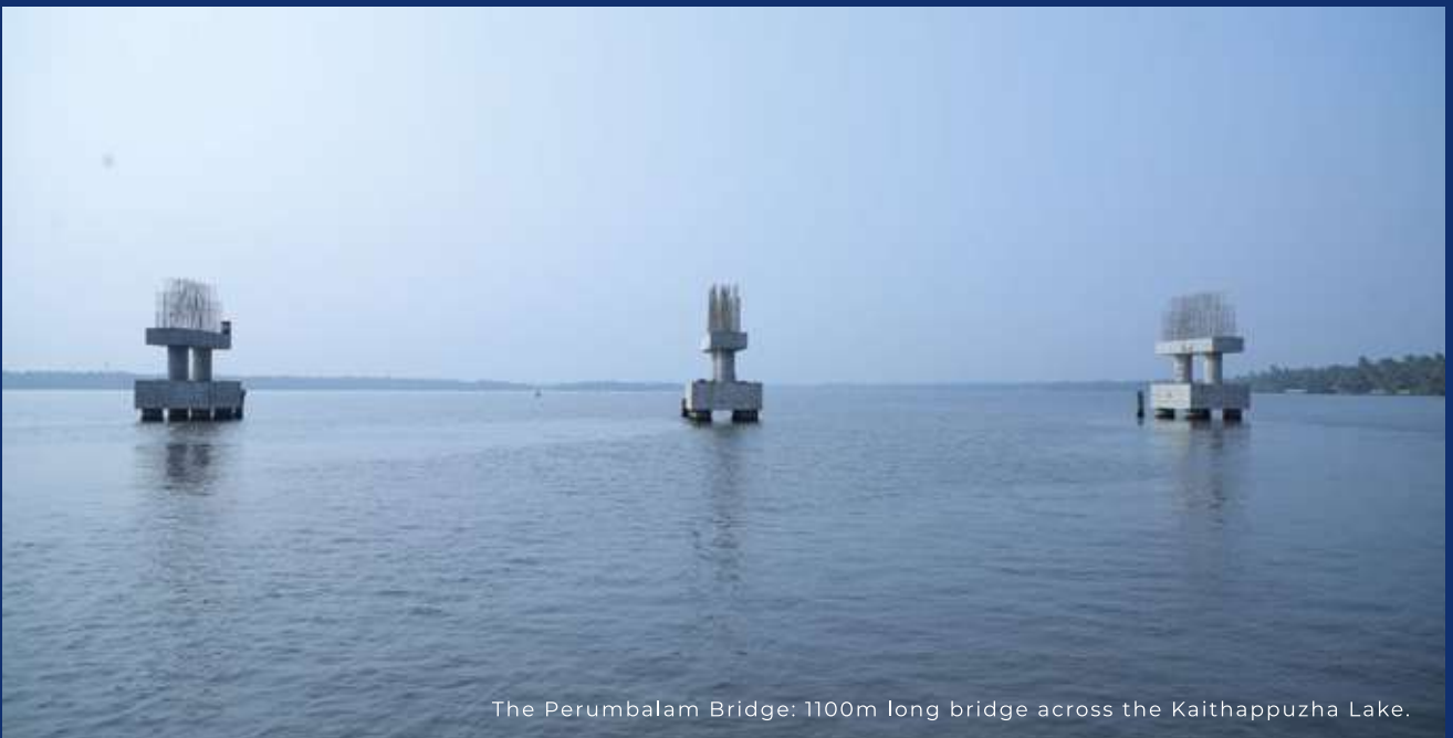
The Perumbalam Bridge: 1100m long bridge across the Kaithappuzha Lake.

Taking India ‘forward to the future’ through innovative, futuristic and sustainable infrastructural solutions.